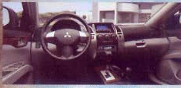
• Two-Tone Dashboard with Titanium and Woodgrain Accent • 3-Spoke Leather-Wrapped Steering Wheel • Leather-Wrapped Shift Knobs