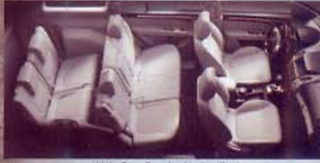
• Light Gray Genuine Leather Seats • Moulded Door Trims with Bottle Holder • Titanium and Woodgrain Accents