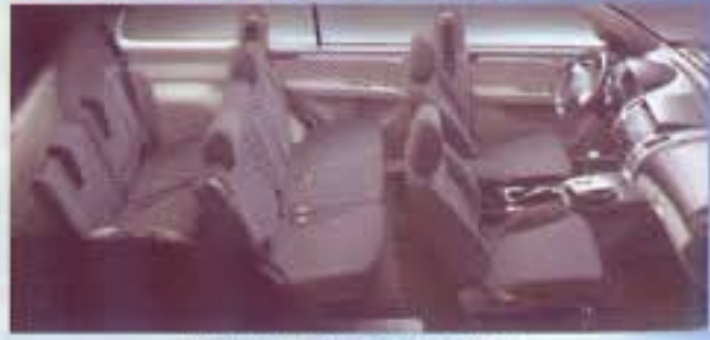
• Black Water-Repellant Fabric Seats • Moulded Door Trims with Bottle Holder • Titanium Accent