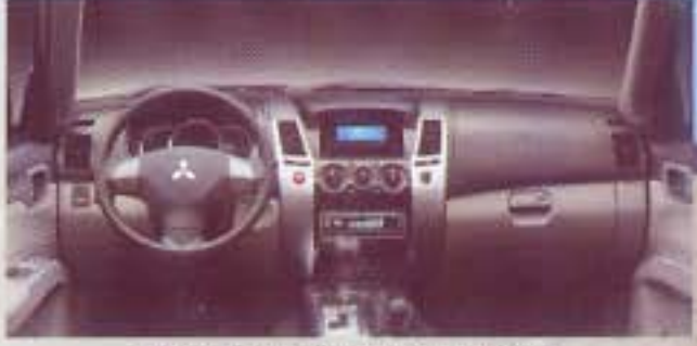
• Two-Tone Dashboard with Titanium Accent • 3-Spoke Leather-Wrapped Steering Wheel • Leather-Wrapped Shift Knobs