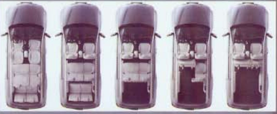
Various Seating Configuration

DEALER OPTION • GLS SE: Tire Pressure Monitoring System (TPMS) • Reverse Sensors 1. Mitsubishi Motors Philippines Corporation reserves the right to alter any specification without prior notice. 2. Photos shown in this flyer may vary from actual unit.