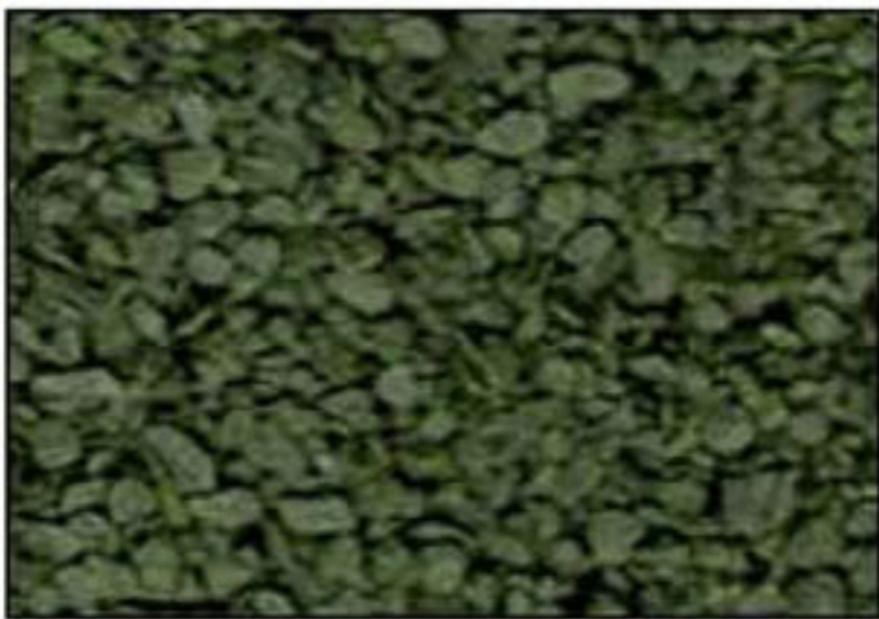
POLYFLEX with GRANULES